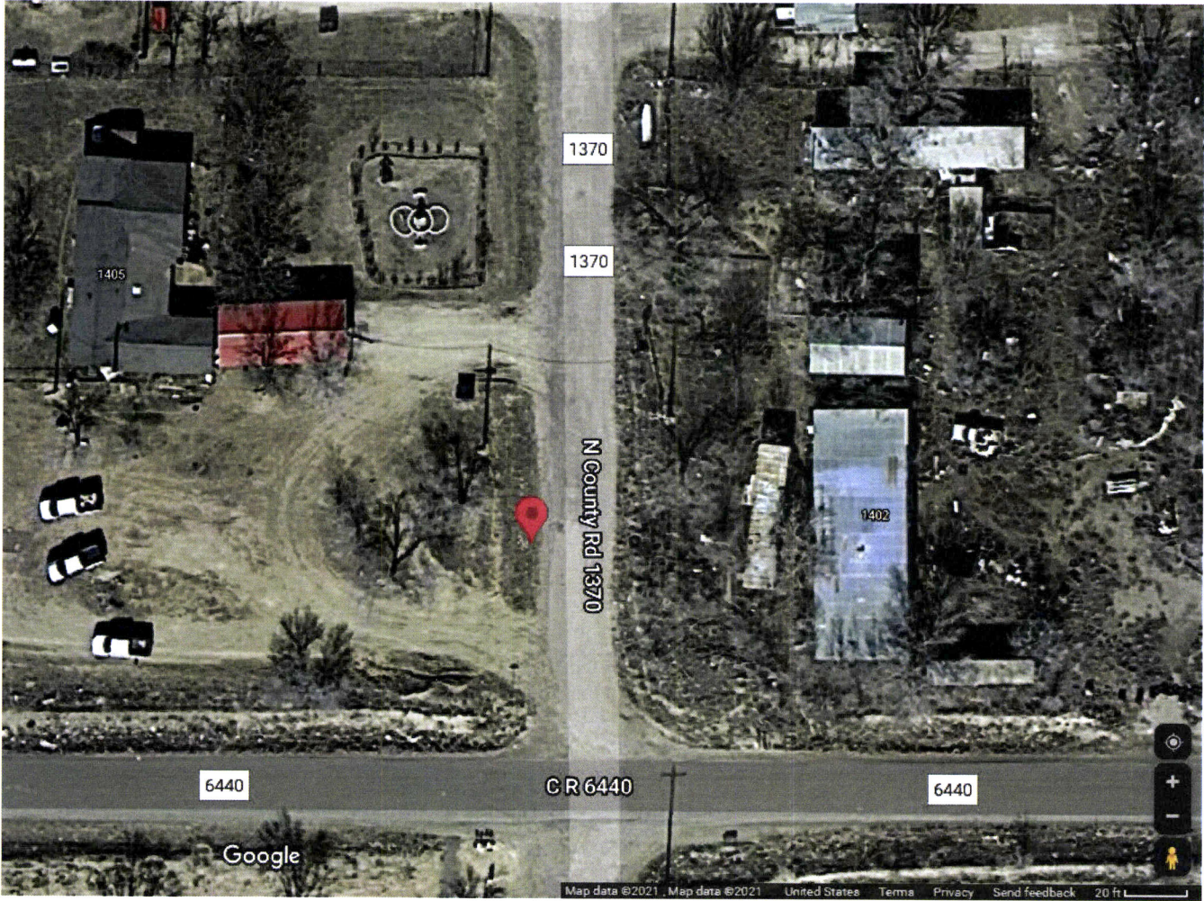
Well location REEPMW099 (Lubbock County ROW, CR1370)